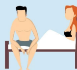
Pain during sex.