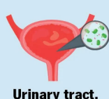
Urinary tract, bladder and pelvic conditions.