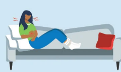
Pain in your flank, abdomen, pelvic area or lower back.