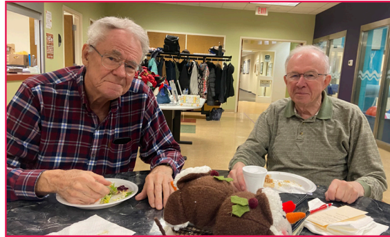
Two handsome dudes