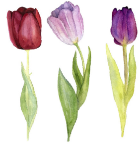
Wednesday Afternoon Art Class