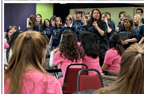
Carmel High School Choirs Swing by to Serenade us at PLE