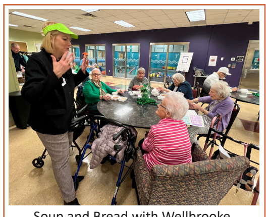
Soup and Bread with Wellbrooke