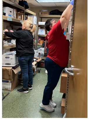
IU Health Volunteers Making PLE Look Good